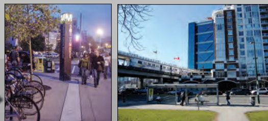
Making the station areas pedestrian and bike-friendly and surrounding them with land use will promote economic development and transit ridership. Placing bus stops adjacent to the rail stations will allow transit riders easy access to multiple transportation options and make transfers easy, and thus more likely to be utilized.