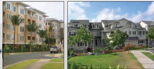
Attractive workforce housing can be mixed with market rate housing. Blending household incomes also allows for greater diversity within the neighborhoods.