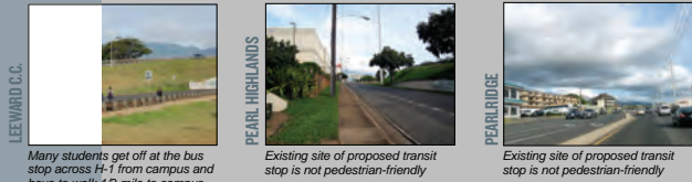
LEEWARD C.C. Many students get off at the bus stop across H-1 from campus and have to walk 1/2 mile to campus. PEARL HIGHLANDS Existing site of proposed transit stop is not pedestrian-friendly PEARLRIDGE Existing site of proposed transit stop is not pedestrian-friendly