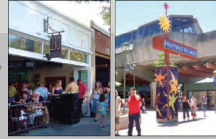
Stores and restaurants that open to the sidewalk help to bring vitality to the pedestrian realm. Pedestrian plazas at the entry/exit point of train loading helps activate the station area.