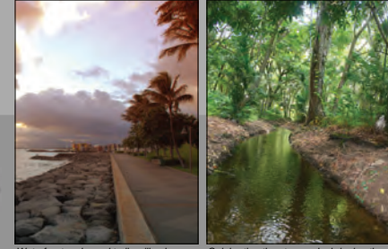
Waterfront parks and trails will enhance the character of the neighborhood and strengthen the sense of place. Celebrating the streams by bringing them back to their natural state is more aesthetically pleasing and better for the environment.