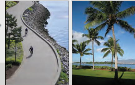
Access to the Pearl Harbor Historic Trail is vital to the success of these neighborhoods. Views of Pearl Harbor are something that is unique. This waterfront area should be celebrated rather than ignored