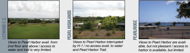
LEEWARD C.C. Views to Pearl Harbor avail. from 2nd floor and above / access to water and trail is very limited. PEARL HIGHLANDS Views to Pearl Harbor interrupted by H-1 / no access avail. to water and Pearl Harbor Trail. PEARLRIDGE Views to Pearl Harbor are available, but not pleasant / access to harbor is available, but limited.