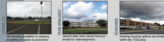
LEEWARD C.C. No housing available on campus, but plenty of space to accommodate. PEARL HIGHLANDS Vacant sites near transit have potential for redevelopment. PEARLRIDGE Existing housing options are limited within the TOD area.