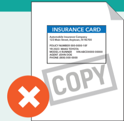
Printed copy not acceptable