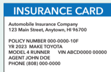
Valid motor vehicle insurance