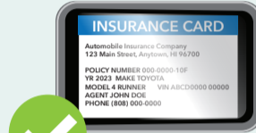
Electronic insurance card acceptable, including mobile app and screenshot