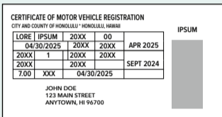
Current vehicle registration certificate