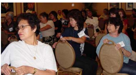
Participants at Conference.

As the day ended, many departed with a sense of accomplishment. They had questions answered and were armed with a wealth of information to help them to be more effective caregivers. They eagerly await the next opportunity for a caregivers conference.