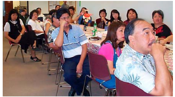
City & County employees at Kapolei Hale for educational support session.

Bishop Street building for people working in the downtown area. Representatives from the Hawaii Intergovernmental Training Council attended and requested a similar fair at the Federal Building for military and government staff who work island-wide.